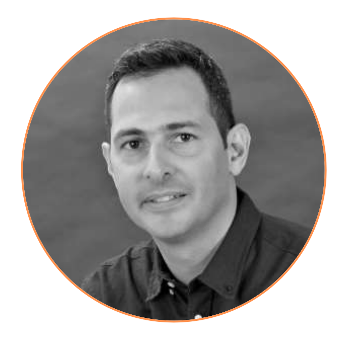
Everything around us was once innovative. Future is as simple as present.